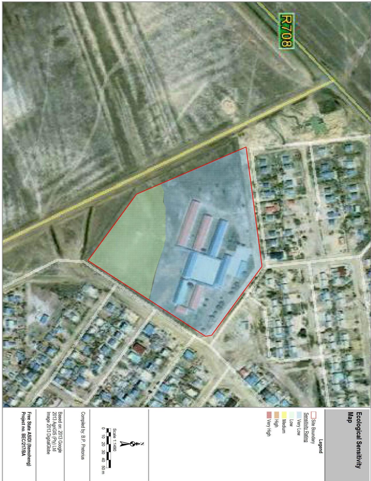
Figure 2: Sensitivity Map