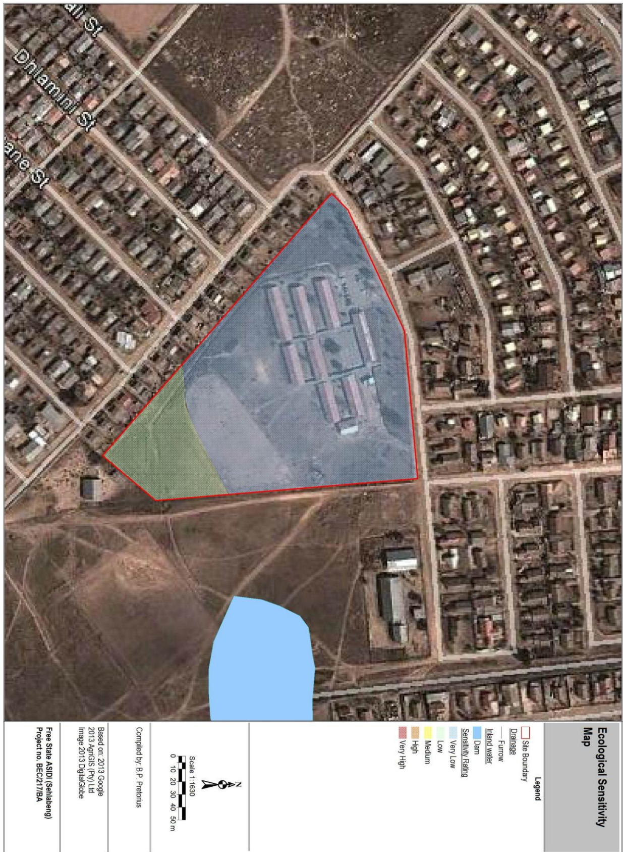
Figure 2: Sensitivity Map