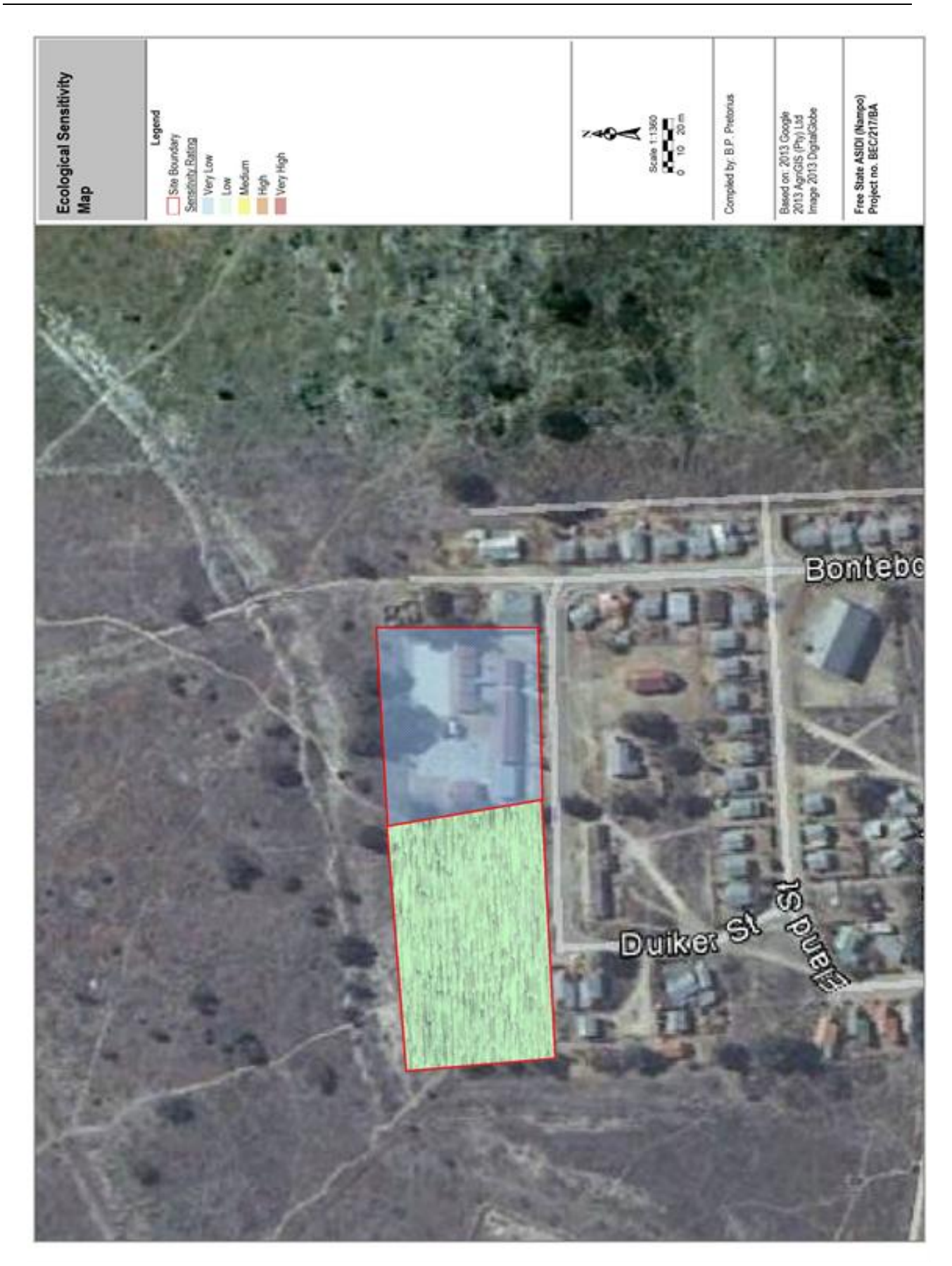
Figure 2: Sensitivity Map