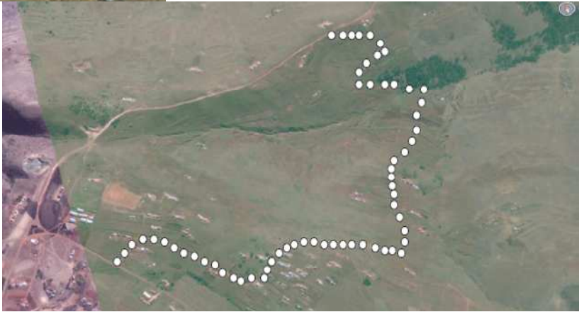
Figure 2: Mandawe access road