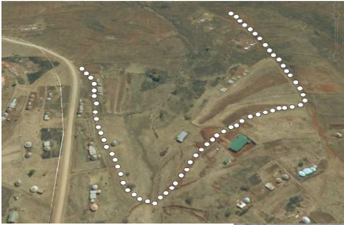
Figure 1: Bhidla access road