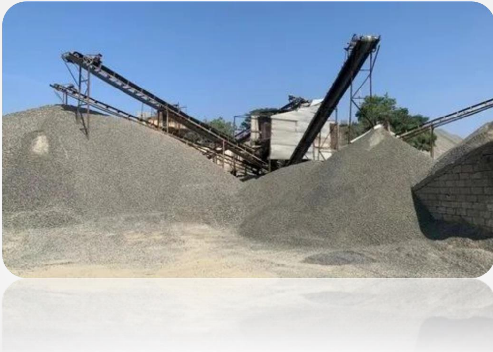
Figure 2: Typical Example of Jig Plant on site

This project is about Granite Processing Plant which utilizes a Jig to prepare desired product. Granite preparation plants typically employ several parallel circuits of cleaning and dewatering operations, with each circuit designed to optimally treat a specific size range of granite. Jigging is one of the important techniques used for the washing of granite in coarser size range and is based on the difference in the specific gravity of the solid particles. In the jig, the separation of materials of different specific gravity is accomplished in a bed which is rendered fluid by a pulsating current of water so as to produce stratification. The aim is to dilate the bed of solid particles being treated and to control the dilation so that the heavier, smaller particles can penetrate the interstices of the bed and the larger high specific gravity particles can fall under a condition probably like hindered settling. Particles of different densities are then likely to segregate when they settle. Repeating such an operation makes the lighter particles remain on the top layer and the heavier particles drop down to the bottom layer.