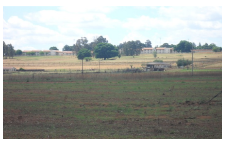
The EIA Process. What does it involve?

Eskom, National and Provincial Government, various other authorities, environmental and technical specialists and stakeholders will work together in the EIA process. The EIA consists of two phases, the Scoping Phase and the EIA Phase. These phases will include: