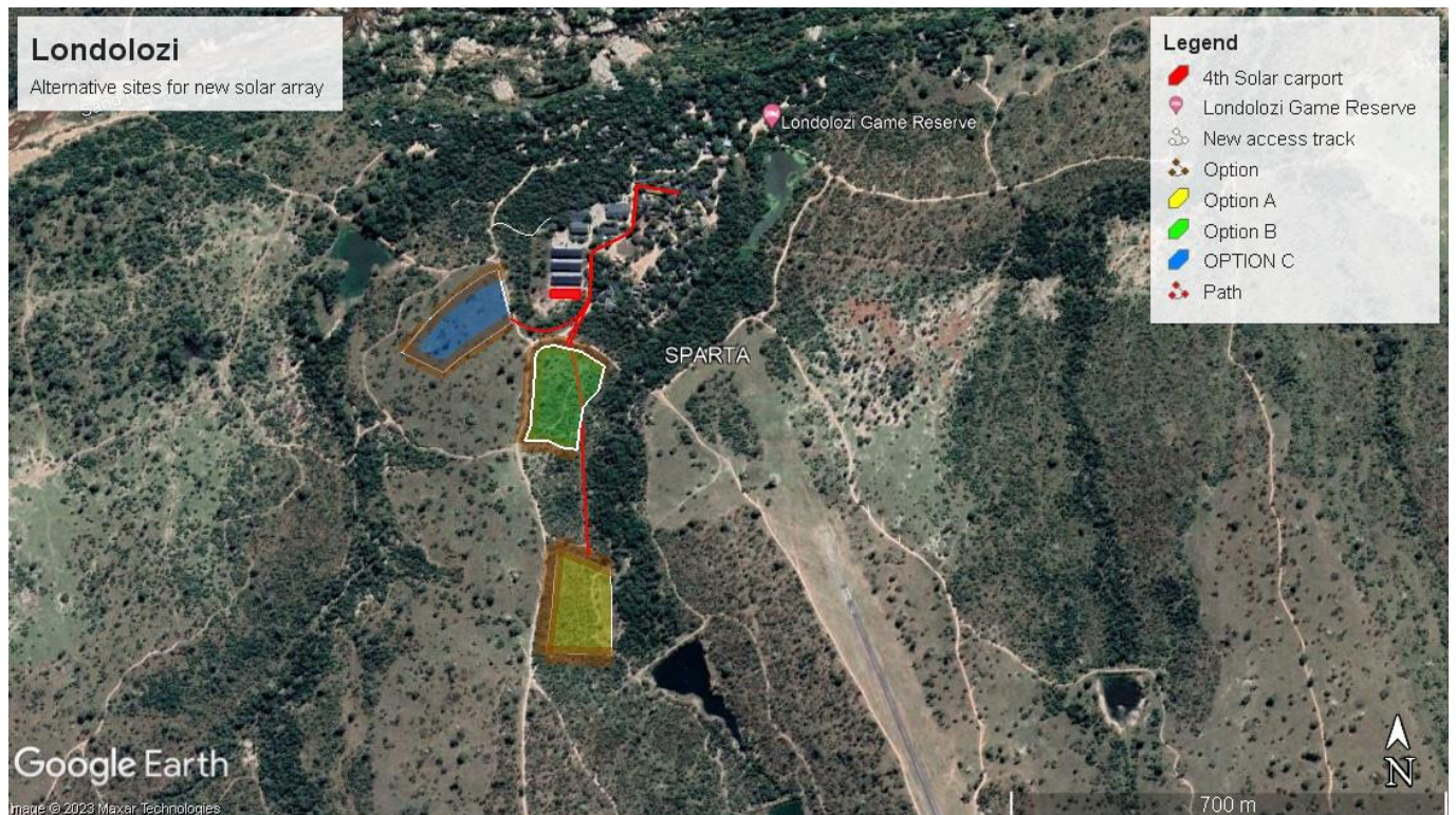
Figure 2: The location of the three alternative sites for the proposed solar array and transmission infrastructure.