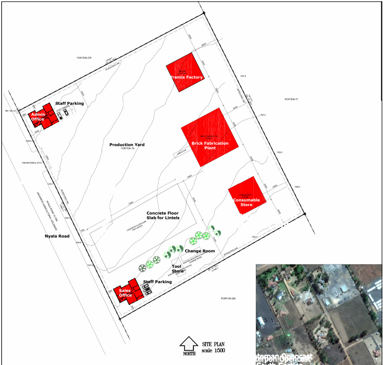
Figure 2: Proposed Site Development Plan (taken from PRLB Designs cc, 2015)