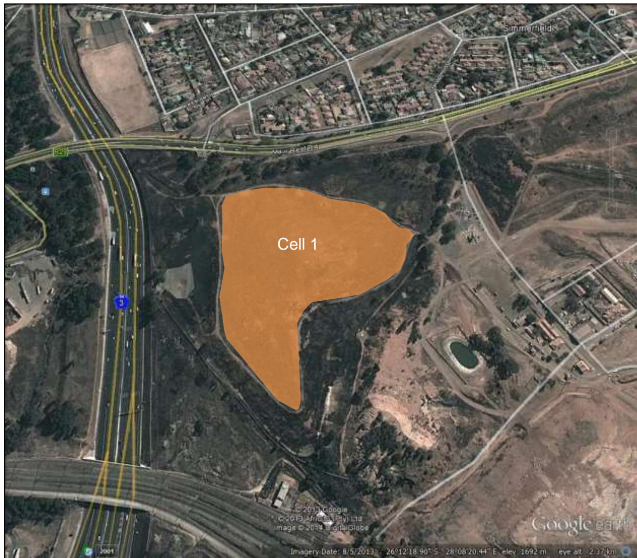
Figure 1: Map showing the location of the proposed site