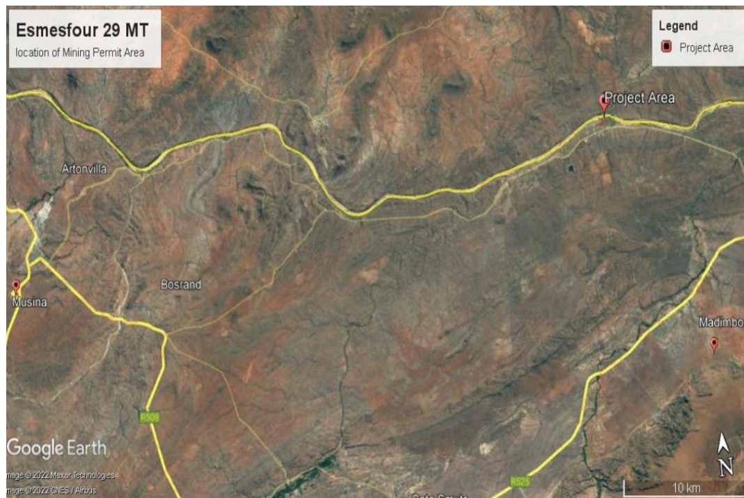
Figure 2: Google Earth View of the proposed project area