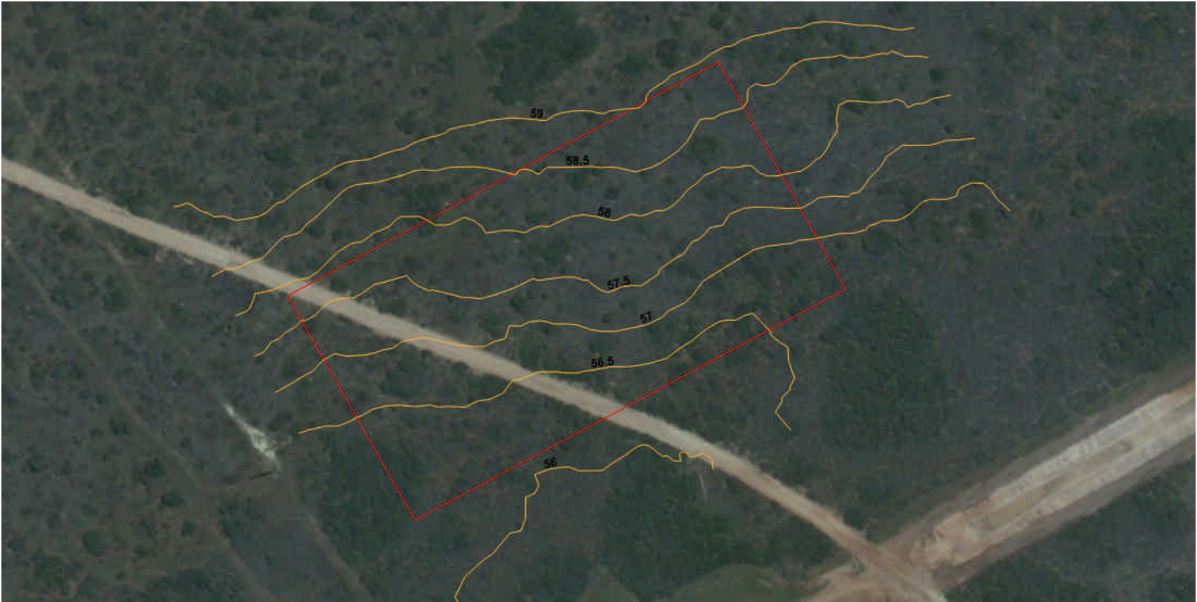
➤ Figure 2: A Google Earth image showing the approximate location of the site (outlined in red).