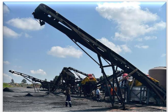
Figure 2: Typical example of a Jig Plant on site