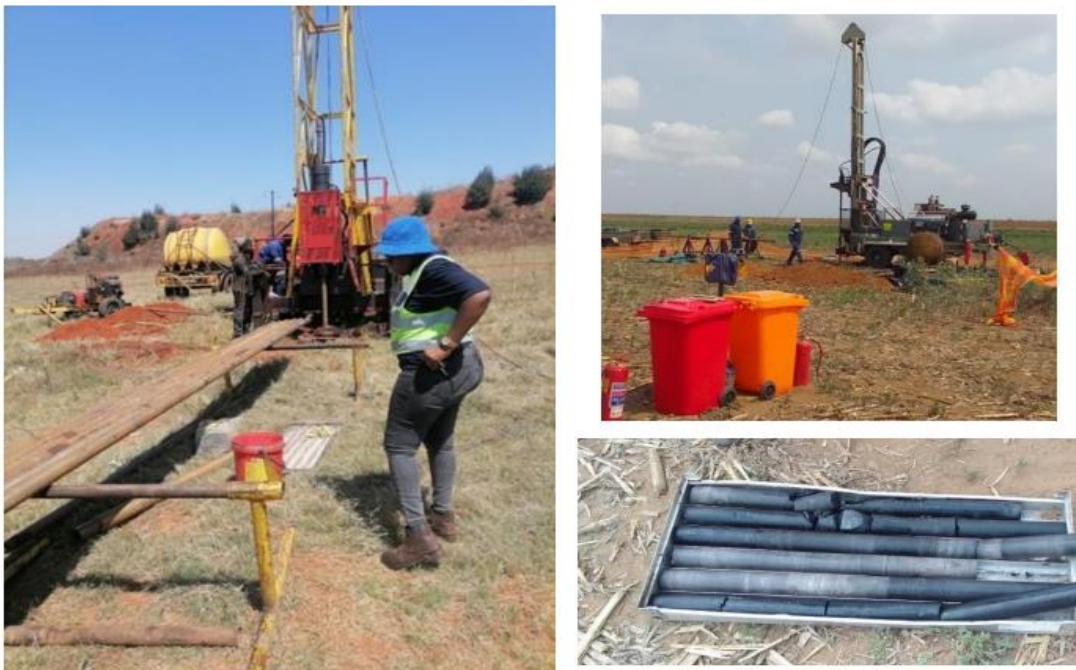
Figure 1: Example of drilling equipment and site setting (Singo Consulting (Pty) Ltd, 2023)

Invasive: A detailed drilling, sampling, assaying and mineralogical study will be carried out. Diamond method will be utilized to prospect the above-mentioned minerals. To ensure or minimize impacts on the receiving environment, All the activities will be guided by the project's BAR & EMPr.