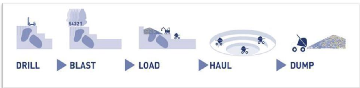
Figure 1: Process for open cast mining

Mining activities will be undertaken over a period of two (2) years. This project will entail an open cast method of excavation. The mine design will be developed according to the dimension of the applied mineral deposit within the project area, but overall mining activities will be limited to an area of 5 Ha as per mining permit requirements. The topsoil will be stockpiled at the permit area boundary and will be used during rehabilitation period. Once a box cut has been made, the overburden and mineral resources where necessary will be loosened by blasting. The loosened material will then be loaded onto trucks by excavators. A haul road will be situated at the side of the open cast, forming a ramp up which trucks can drive, carrying waste rock and coal. Waste rock will be piled up at the surface, near the edge of the open cast (waste dump). The waste dump will be tiered and stepped, to minimize degradation. All the activities will be guided by the project's EMPr such that the project does not impact the environment negatively. The diagram in figure 1 below depicts a simplified sequence of events in open-cast mining.