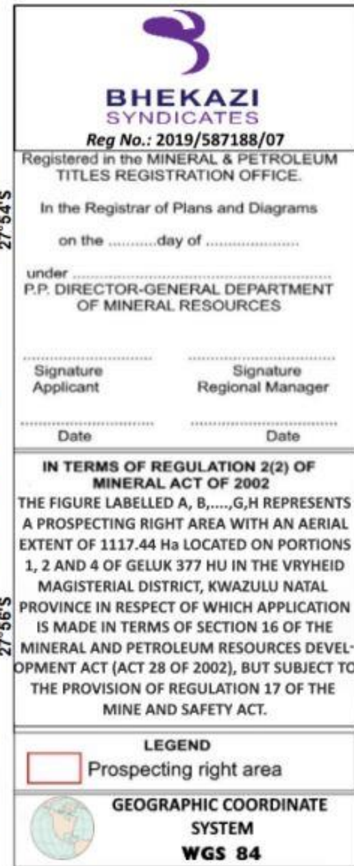
Figure 1: Locality Map of Farm Geluk 377HU Portions 1, 2 & 4.