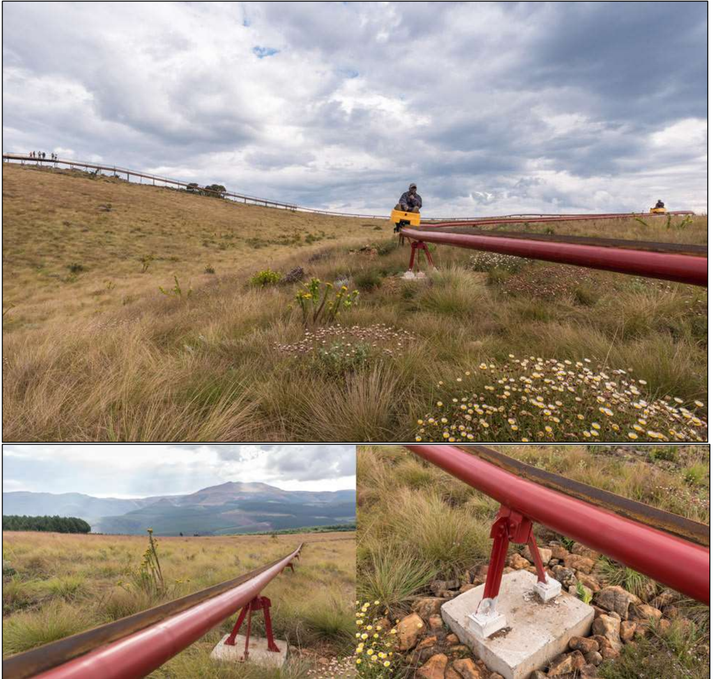
Figure 1: An example of a tobogganing structures

To better understand the concept, you can see an existing tobogganing entertainment facility at this link: http://longtomtoboggan.co.za/ . Figure 1 below gives an example of the proposed development and figure 2 shows the layout.