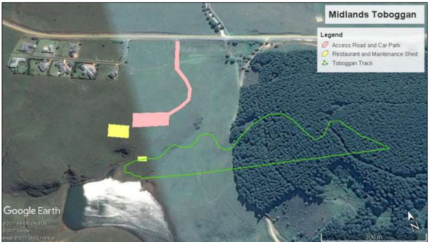
Figure 2: Draft layout plan for the proposed Toboggan development

The site would be of low density with infrastructure sensitively placed within the natural environment. The following issues have been identified by the EAP as potential impacts and would, amongst other issues, be investigated during the EIA process: