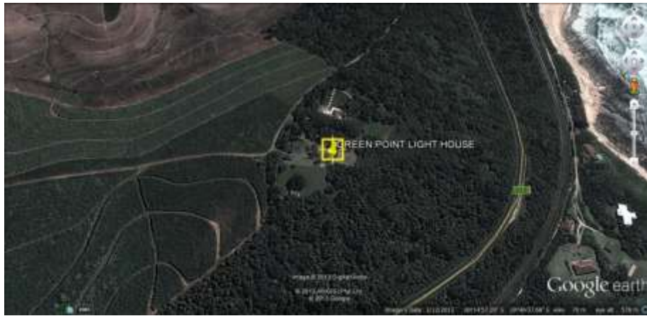
Figure 1: Map showing the location of the proposed communication mast