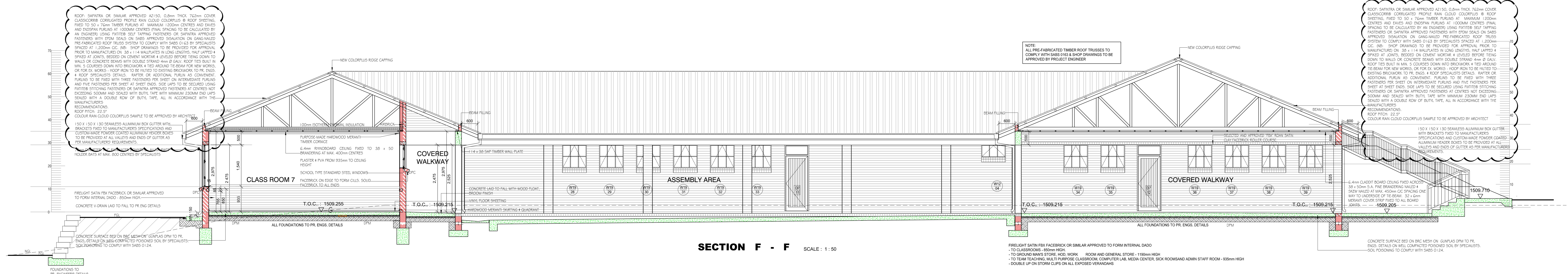
SECTION F - F SCALE : 1 : 50