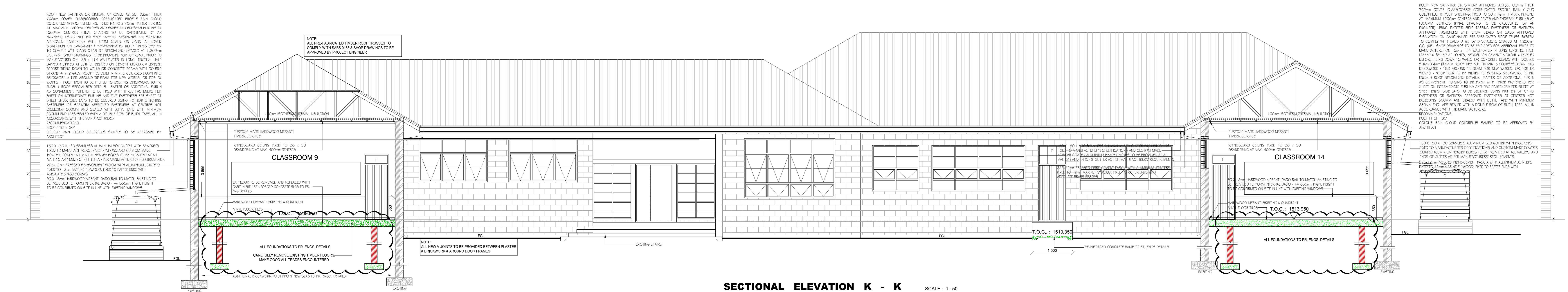
SECTIONAL ELEVATION K - K SCALE : 1 : 50