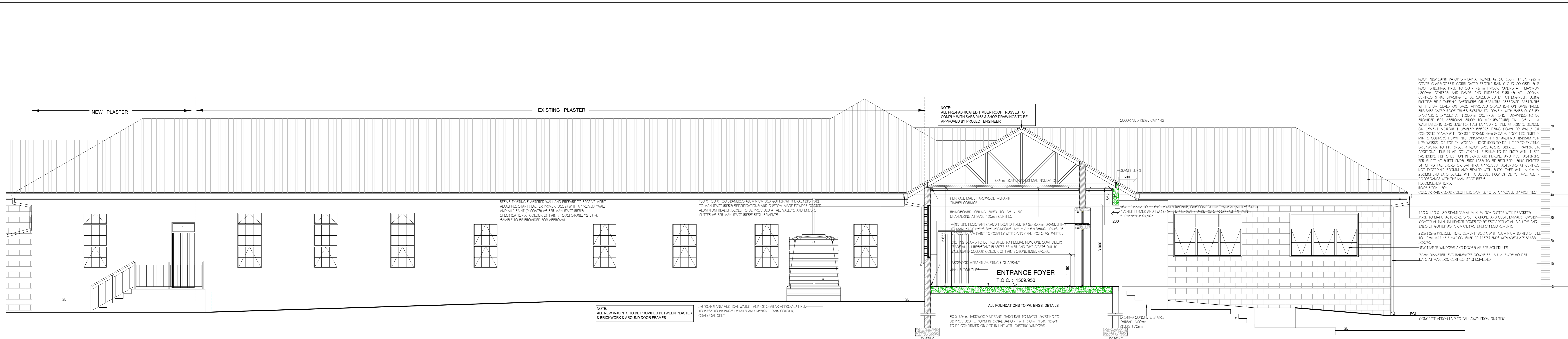
SECTIONAL ELEVATION J - J SCALE : 1 : 50