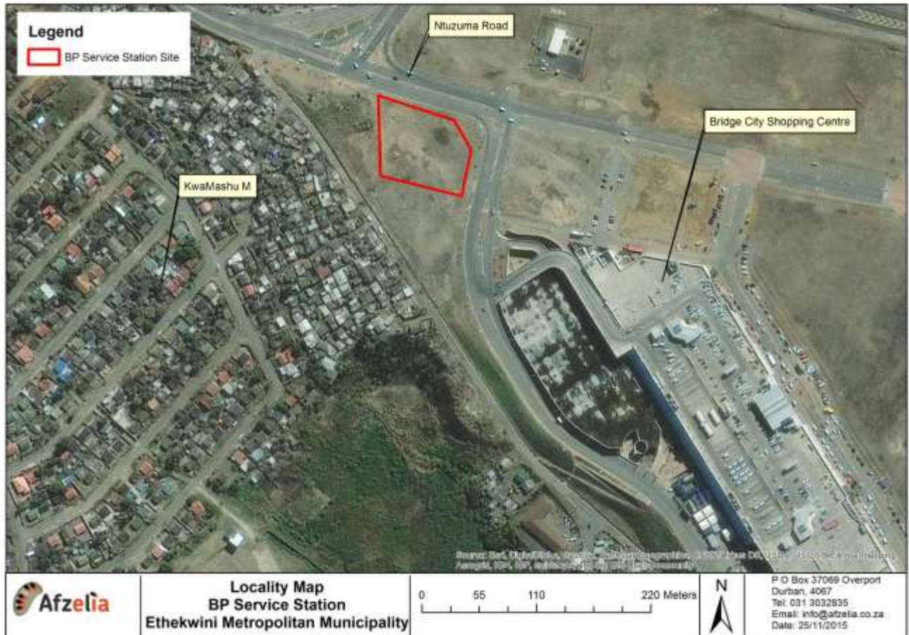
Figure 1: Locality map for the proposed BP Service Station in KwaMashu

The geographical co-ordinates of the proposed development site are indicated in Table 1 below: