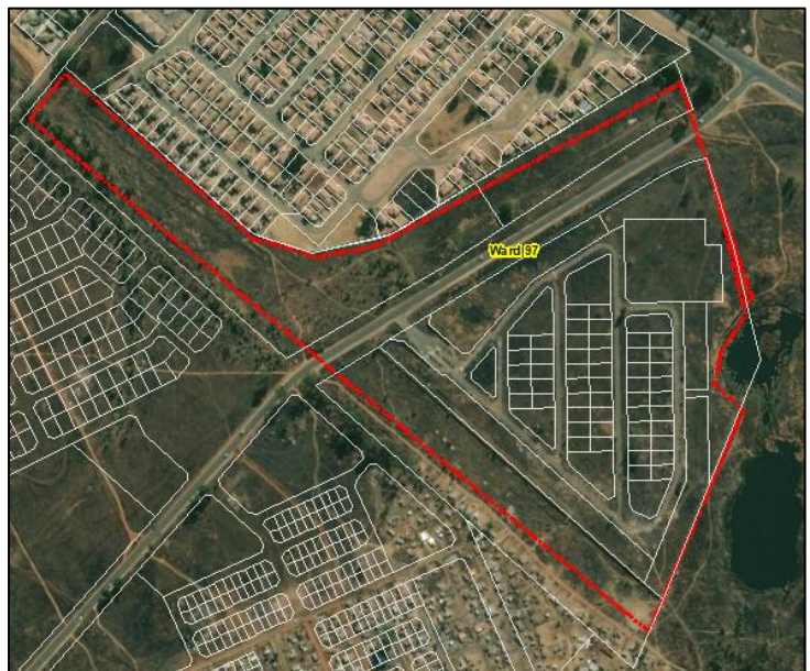
Figure 1: Proposed Project Area

The project area is currently vacant. It should be noted that the site is fenced/walled off and internal roads have previously been constructed. No CBAs, ESAs and protected areas have been identified however majority of the site is classified as HPAL, graves are present, and a non-perennial watercourse is adjacent to the east of the property.