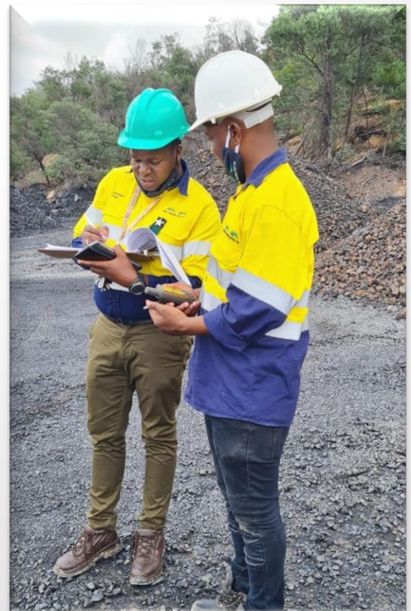
Figure 3: Typical Example of activities to be undertaken