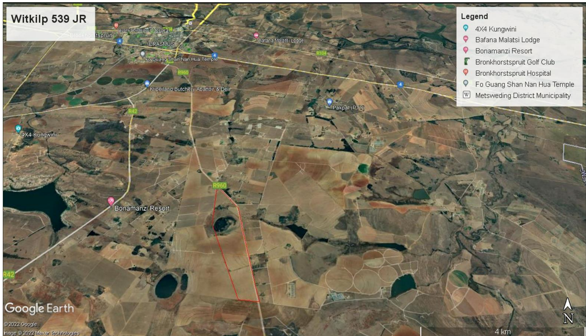
Figure 2: Google Earth View Map of the proposed project area