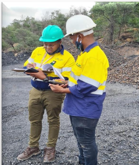
Figure 3: Typical Example of activities to be undertaken