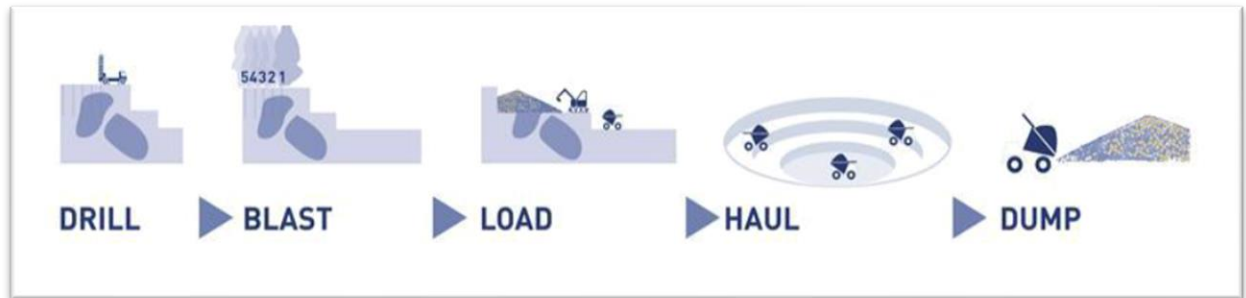
Figure 1: Process for open cast mining

drive, carrying ore and waste rock. Waste rock will be piled up at the surface, near the edge of the open cast (waste dump). The waste dump will be tiered and stepped, to minimize degradation. All the activities will be guided by the project's EMPr such that the project does not impact the environment negatively. The following simplified diagram depicts the sequence of events in open-cast mining: