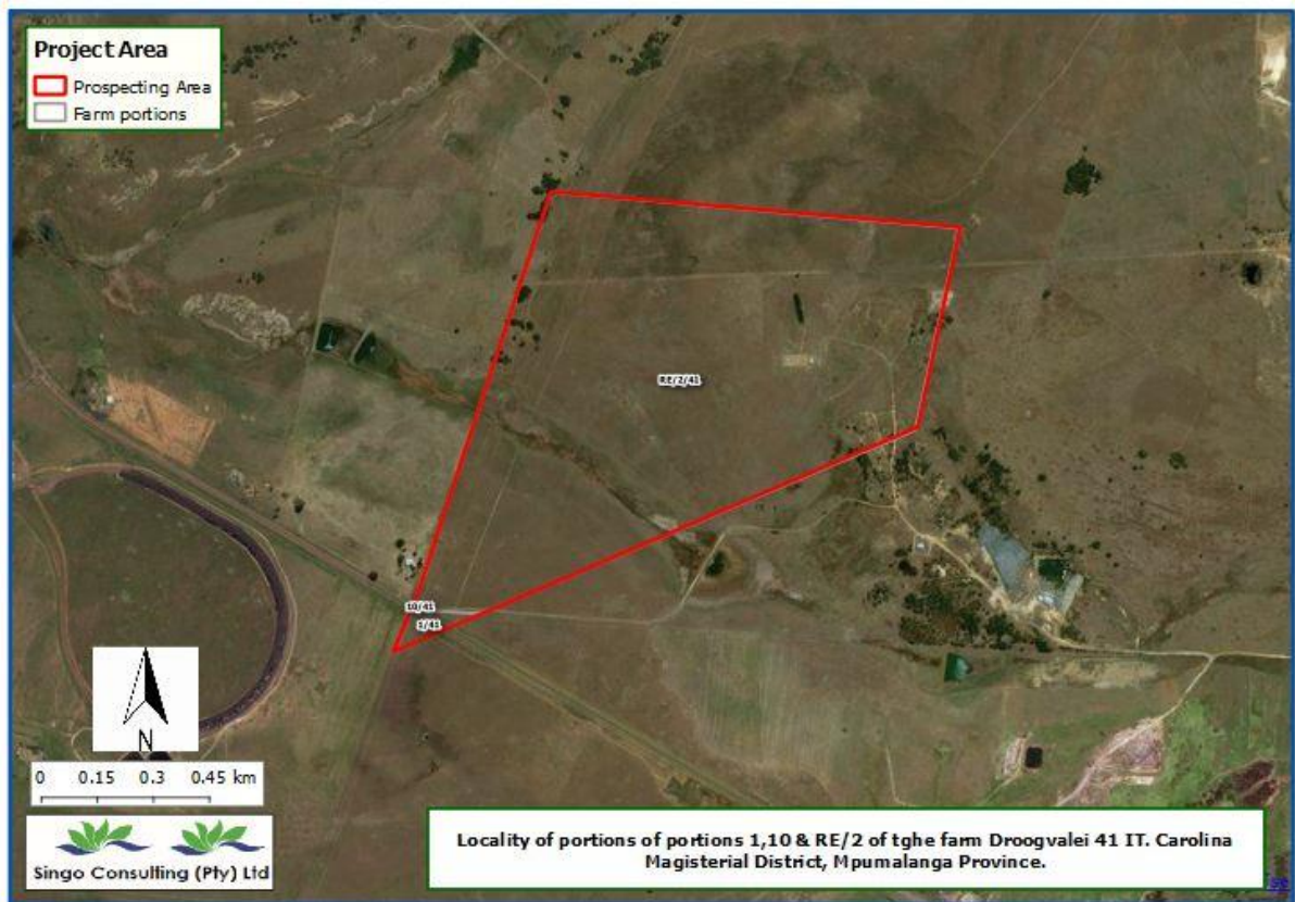
Figure 1: Locality Map of the Proposed Project Area (A: -26.0875, 30.145913)