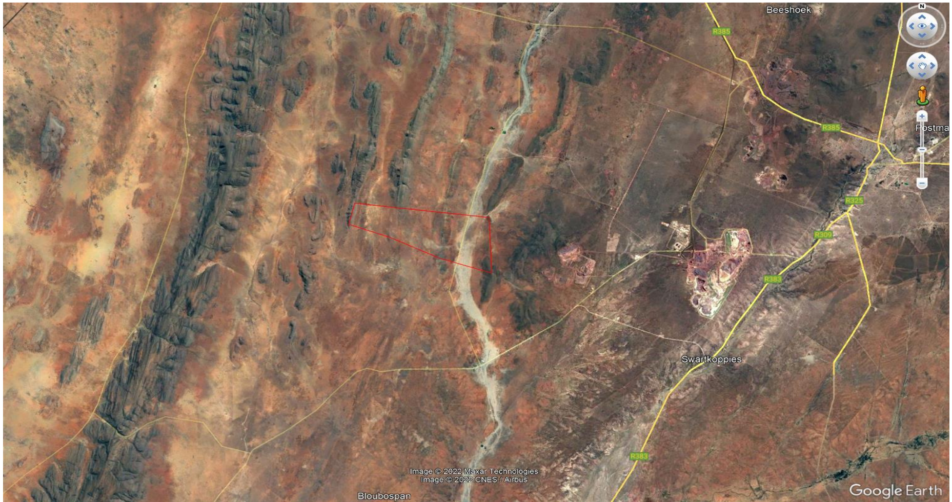
Proposed area on Google earth picture