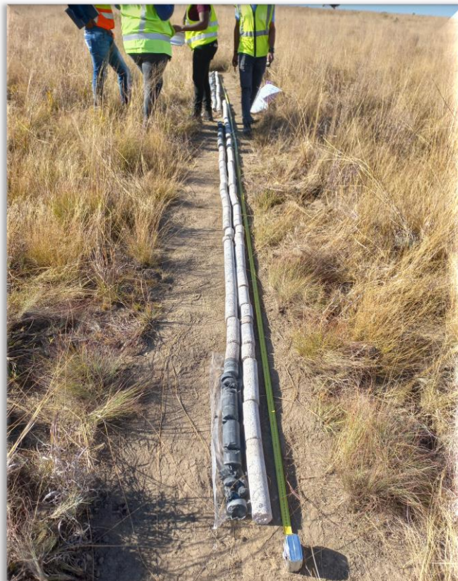
Figure 3: Typical Example of activities to be undertaken.