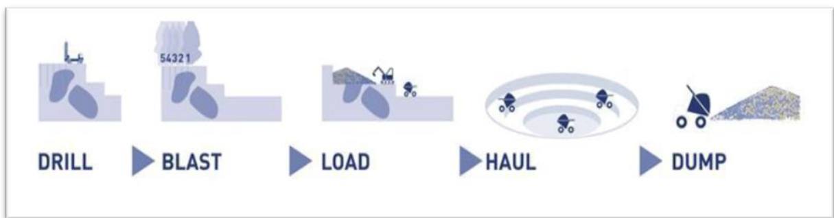
Figure 1: Coal extraction process

topsoil will be stockpiled elsewhere on site preferably next to the farm boundary and will be used during rehabilitation period. Once a box cut has been made, the overburden and mineral resources where necessary will be loosened by blasting. The loosened material will then be loaded onto trucks by excavators. A haul road will be situated at the side of the open cast, forming a ramp up which trucks can drive, carrying ore and waste rock. Waste rock will be piled up at the surface, near the edge of the open cast (waste dump). The waste dump will be tiered and stepped, to minimize degradation. All the activities will be guided by the project's EMPr such that the project does not impact the environment negatively.