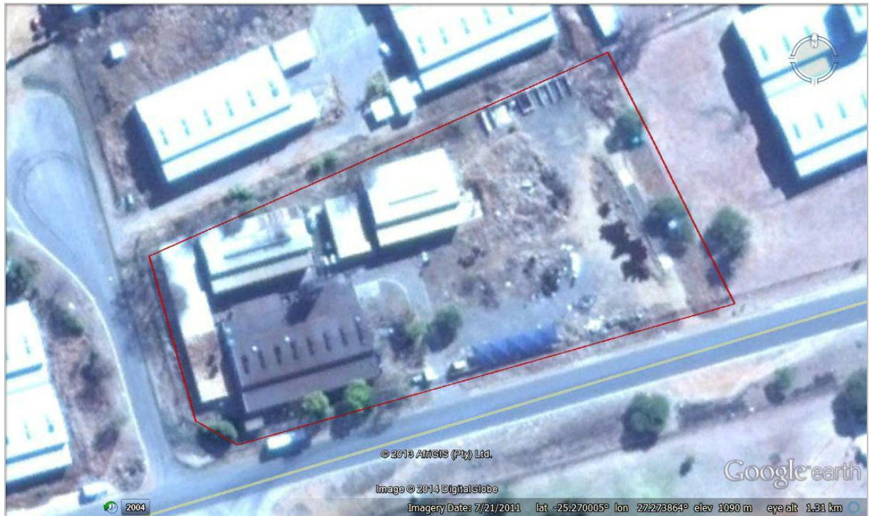
Figure 1: Google earth image of site