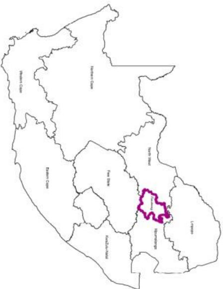
Fig. 1. Location of IDCNKE Holdings on Portion 348 of Kameeldrift Farm 313, with proposed expansion sites.