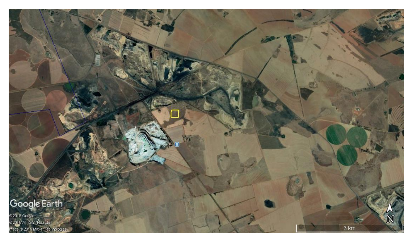
Figure 2: Locality map of the proposed project (depicted by orange colour)