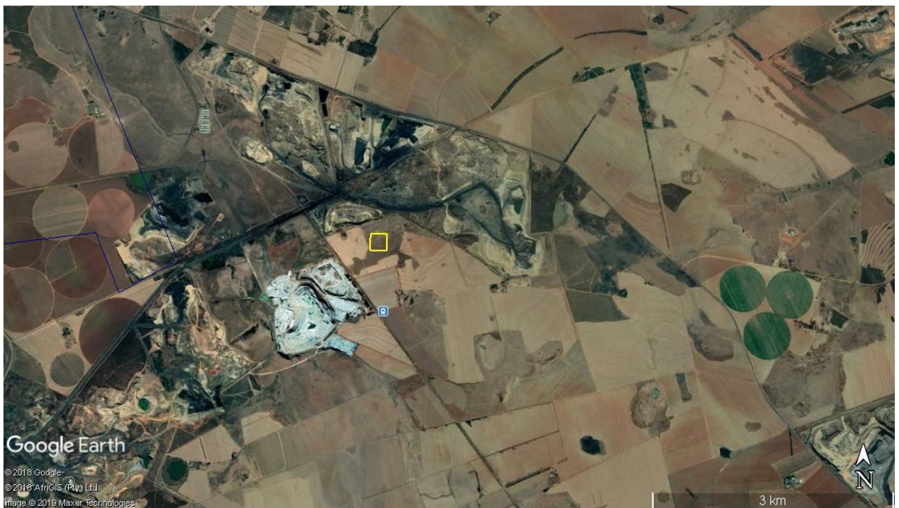
Figure 2: Locality map of the proposed project (depicted by orange colour)