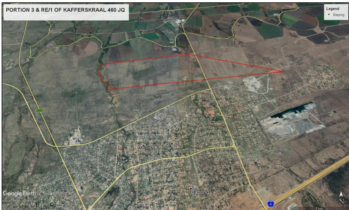
Figure 2: google earth view of the area under study