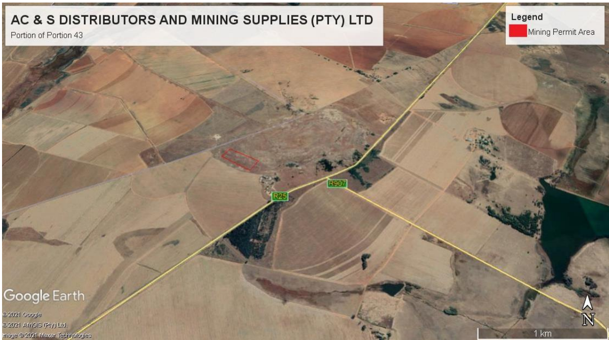
Figure 2: Google Earth Map of the proposed project area