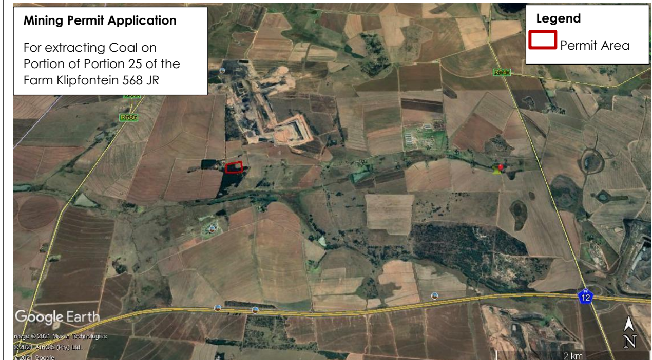
Figure 2: Google Earth Map of the proposed project area