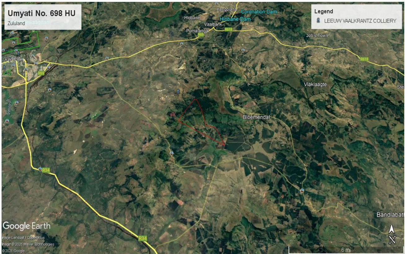
Figure 2: Google Earth Map of the Proposed prospecting Project Area.