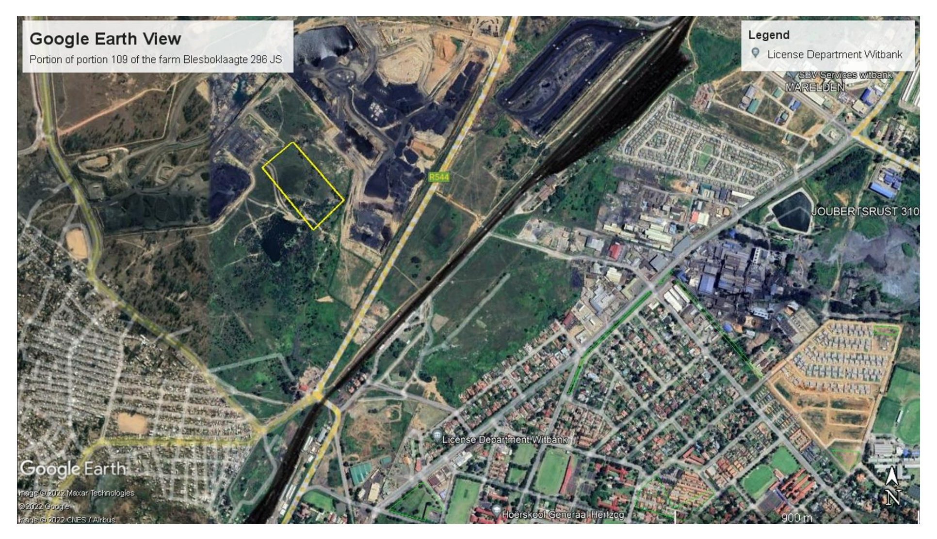
Figure 2: Google Earth Map of the proposed project area