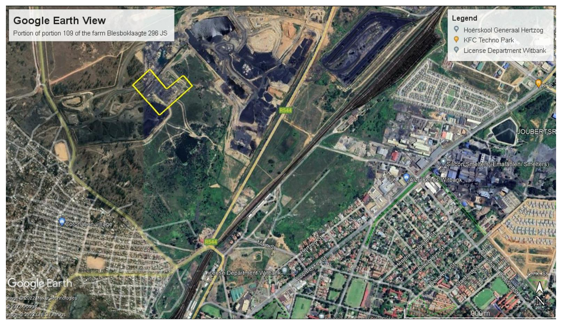
Figure 2: Google Earth Map of the proposed project area