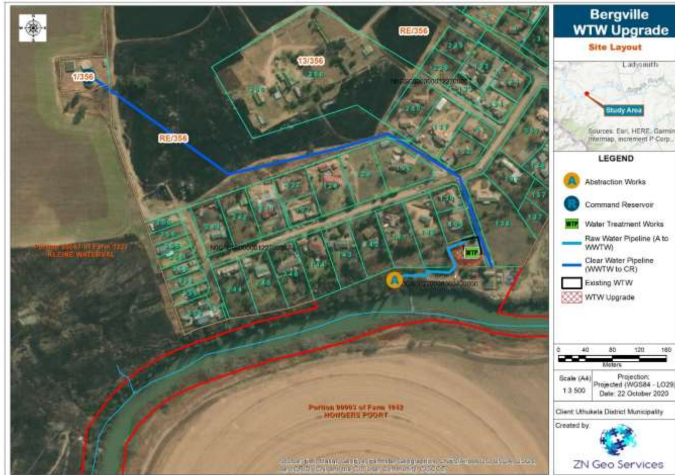
Figure 2: Site Layout Map