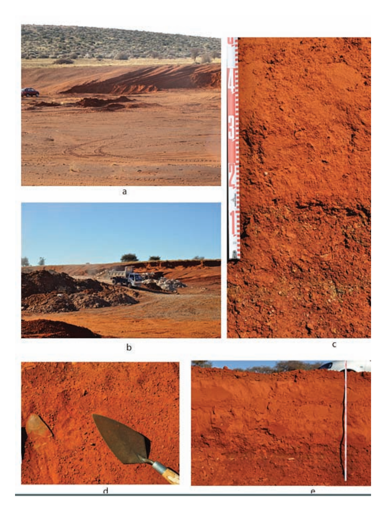
Bestwood 1: a) the site looking north in 2010 before mining of the gravels began; b) the site in 2011 with mining in process. Note that trucks arrive at the quarry with debris from preparing construction sites, mostly blocks of calcrete, which are dumped before the gravel is collected; c) detail of the section showing the interface between the sand and the underlying clay-rich gravel. Scale in cm; d) view of artefact lying flat at the interface between the sand and the underlying gravel; e) overview of section in trench left by the mining of gravel showing the interface between the sands and the underlying gravel.