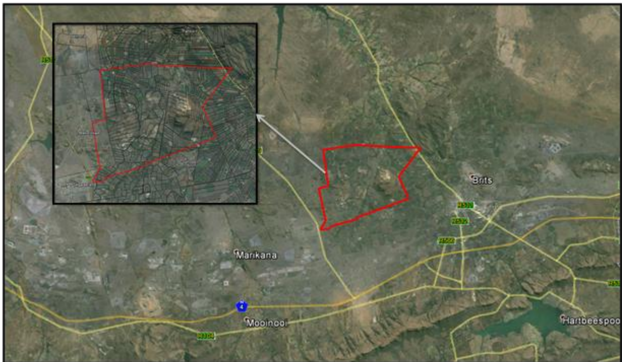
Figure 1: Locality Map

The N4 national road is runs in an east-west direction 8km south of the property and the R556 and R511 run in a north-west direction on the western and eastern sides of the property respectively. Various secondary roads and dirt roads cross through the property from the regional roads mentioned above.