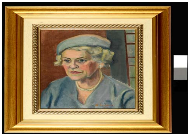
Maggie Laubser “Portrait of a lady wearing a blue dress and hat”