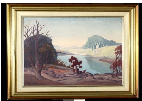
J.H. Pierneef "Transvaal Scene with a Dam in the Foreground"