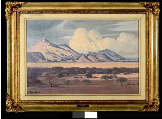
J.H Pierneef "South West African Mountains"

Provenance: The work was purchased at Sotheby's in Johannesburg on 30 January 1982.