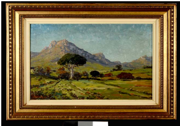
J.H Pierneef “Mountain Landscape”

Provenance: This work of Art was purchased from an itinerant art dealer, circa 1970.