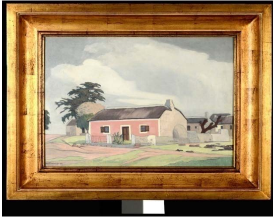
J.H Pierneef “Naby Bredasdorp”

Provenance: The artwork was purchased at Stephen Weltz & Co in Johannesburg on April 2007.