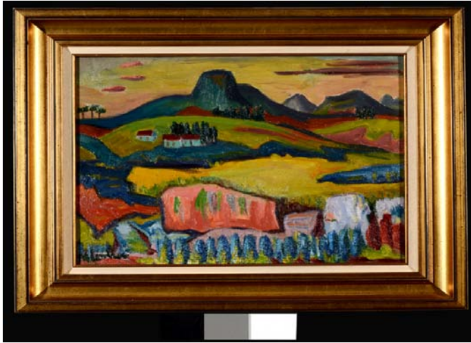
Maggie Laubser “Farmstead with Mountains Beyond”