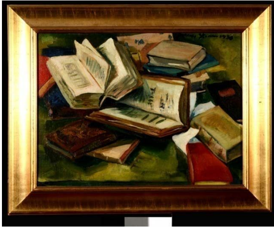
Irma Stern “Books on Table”

Provenance: This was purchased by the owner’s father directly from the artist.