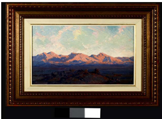
J.H. Pierneef "Okahandjeberge"