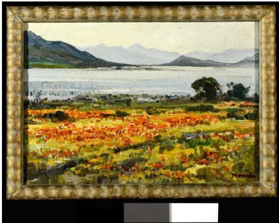
P.H Naude “Coastal Scene near Hermanus”