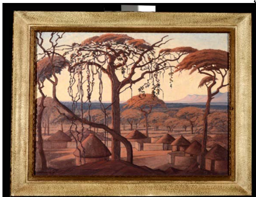
J. H. Pierneef “A View of Chuniespoort”