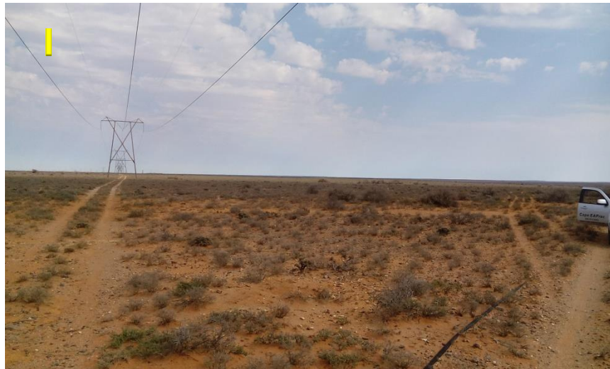
Photo G: South south western view showing the transmission lines running south west to Kronos substation.

Photo H: Western view of the study site.