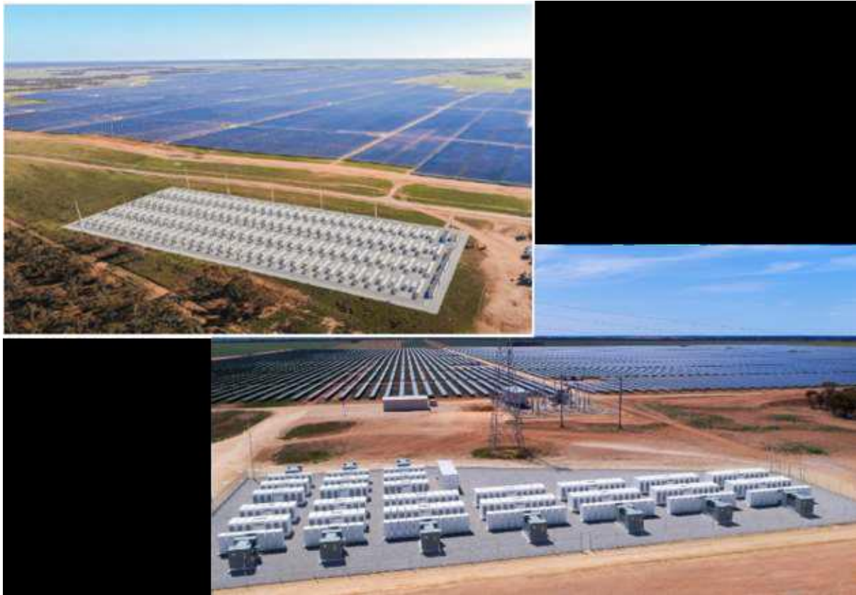
Typical Battery Modules in a BESS with the Separated Sections

Images of Typical Centralized AC Coupled BESS Systems Servicing Solar Power Farms