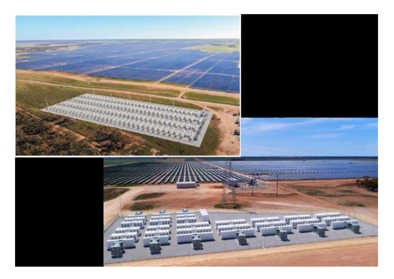
Typical Battery Modules in a BESS with the Separated Sections

Images of Typical Centralized AC Coupled BESS Systems Servicing Solar Power Farms