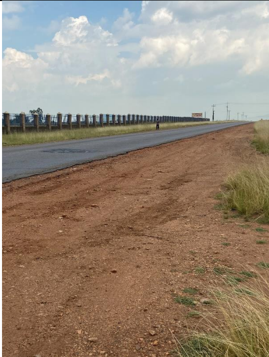
Heidelberg Road (R550) looking west – site blue palisade fencing seen to the south