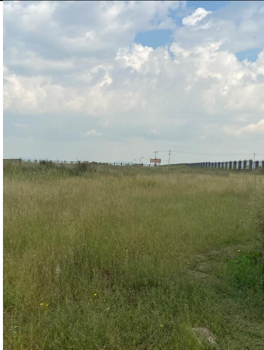
From access road looking towards north western corner - blue palisade fencing along northern boundary