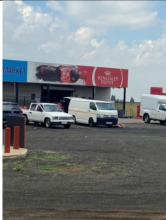
Businesses on site – New Sky Wholesale Market and Coca Cola Kingsley Distribution Klipriver Depot