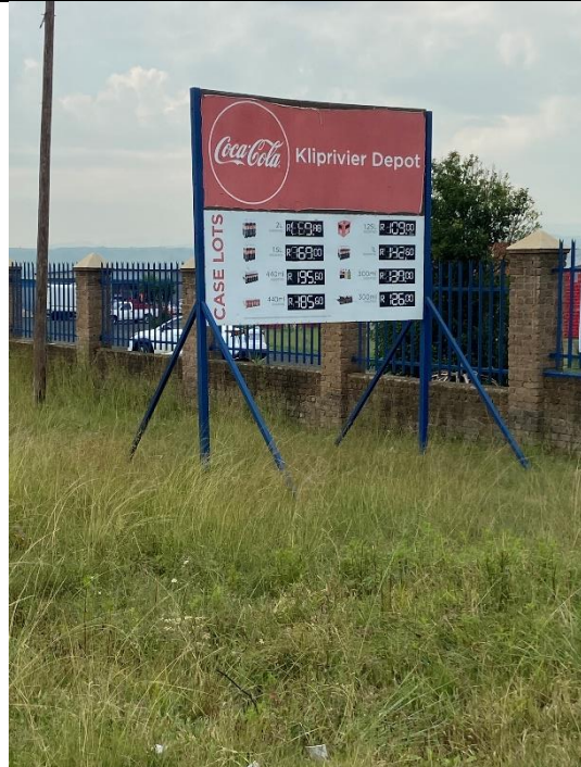
Coca Cola Kliprivier Depot Board along R550 to the east of the access road