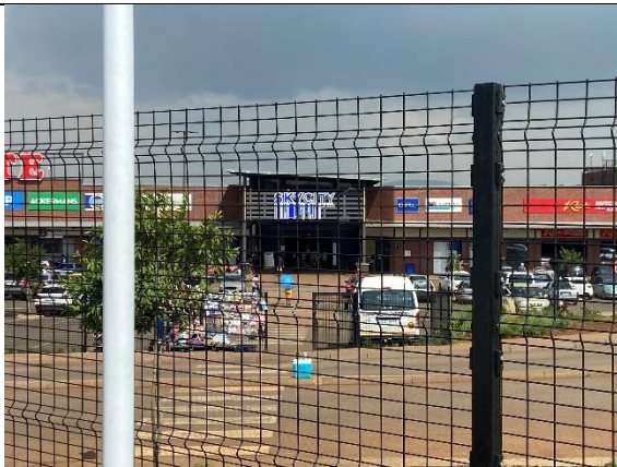
Sky City Shopping Mall approximately 2.5km to the north west