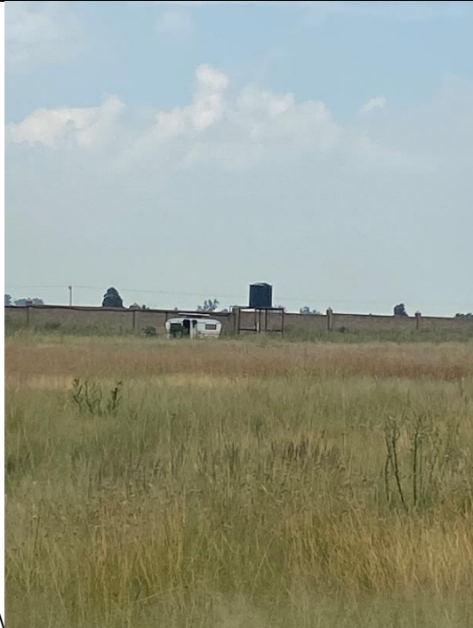
Caravan with Jojo tank