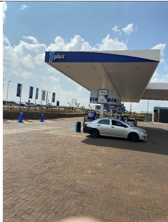
Engen filling station at Sky City