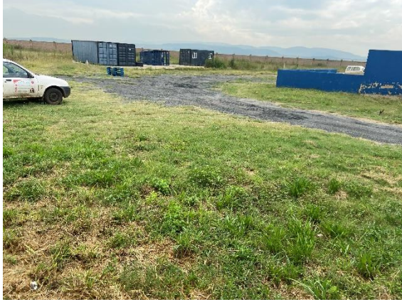
Eastern side of property – east of access road