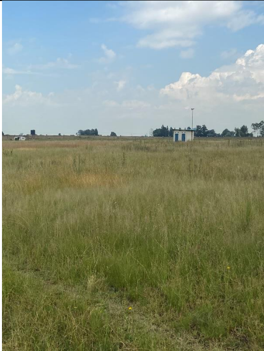
From access road looking towards western boundary and south western corner of site