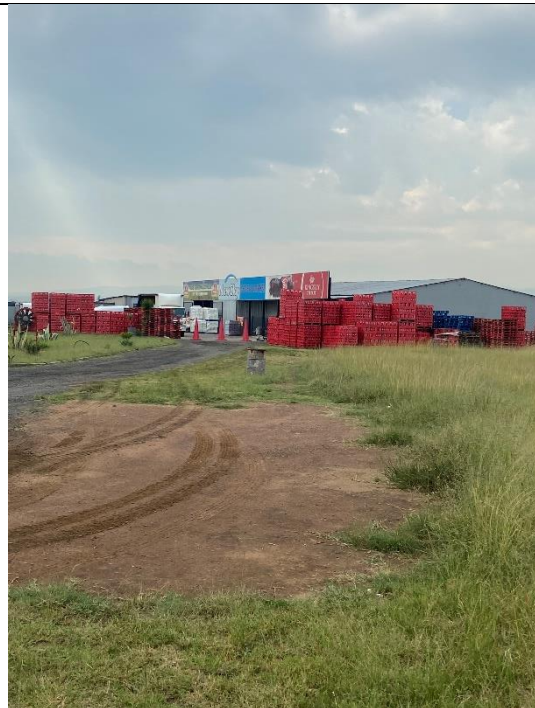
Looking east towards buildings (businesses) from access road