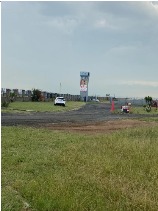
Looking east towards northern boundary from access road