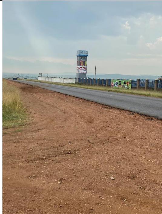
Heidelberg Road (R550) looking east – site board seen to the south