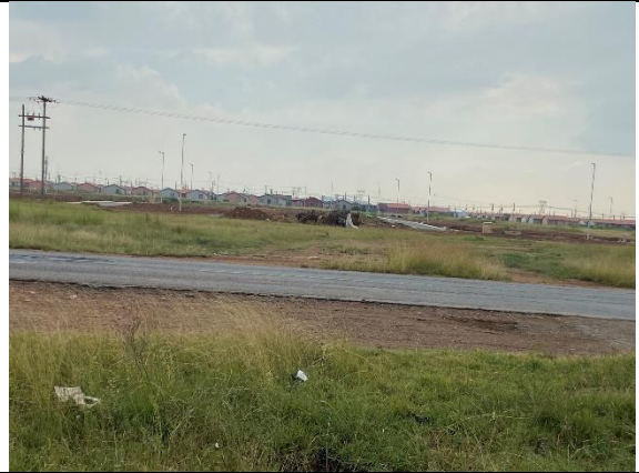
Palm Ridge Extensions north of the R550 (Heidelberg Road) in Ekurhuleni and people walking from the residential area towards the site, crossing the R550.