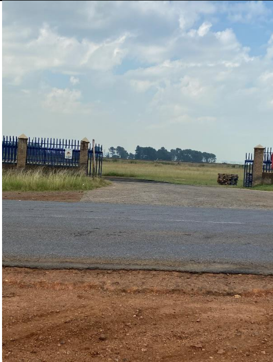
Site access from Heidelberg Road (R550)