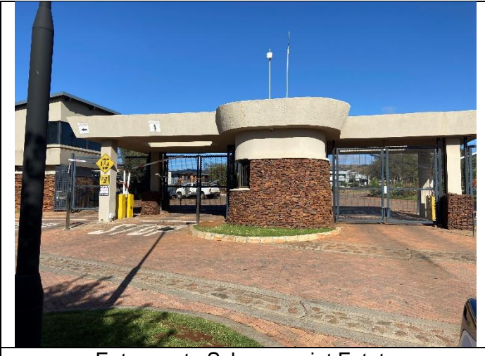
Entrance to Schoongezigt Estate