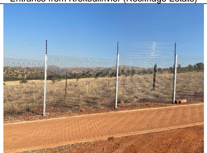
Old fence replaced with new fence due to security problems (Kgaswane boundary). Paved boundary road for patrolling – existing road that was paved.