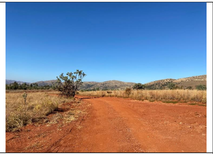
Internal road - view towards Kgaswane