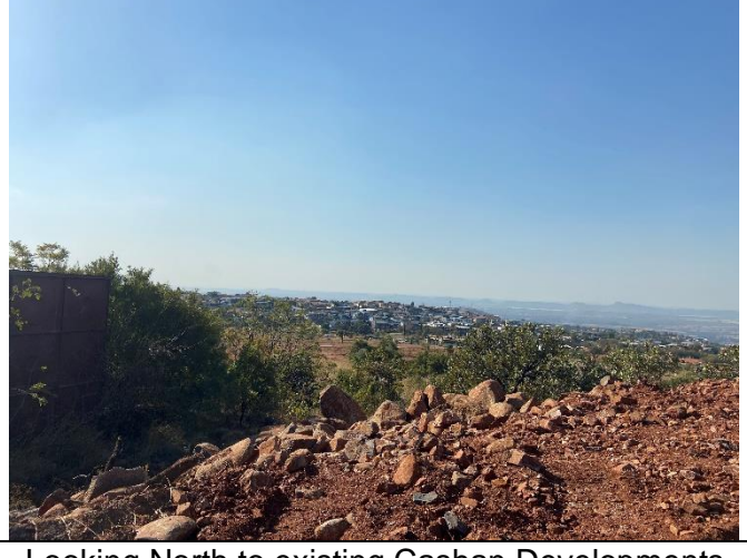
Looking North to existing Cashan Developments