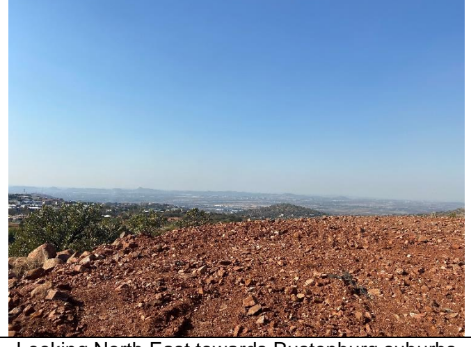
Looking North East towards Rustenburg suburbs