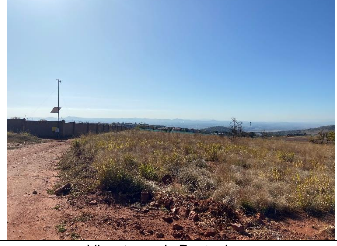
View towards Rustenburg