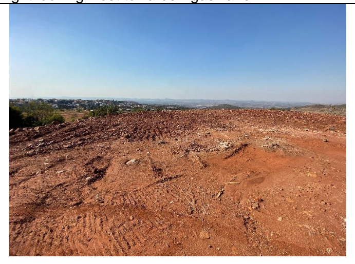
Area disturbed during reservoir construction process had to be levelled and will be rehabilitated