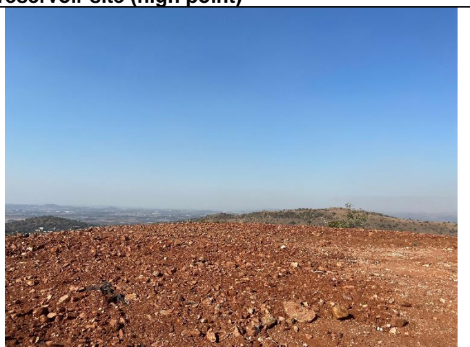
Looking East towards Rustenburg suburbs