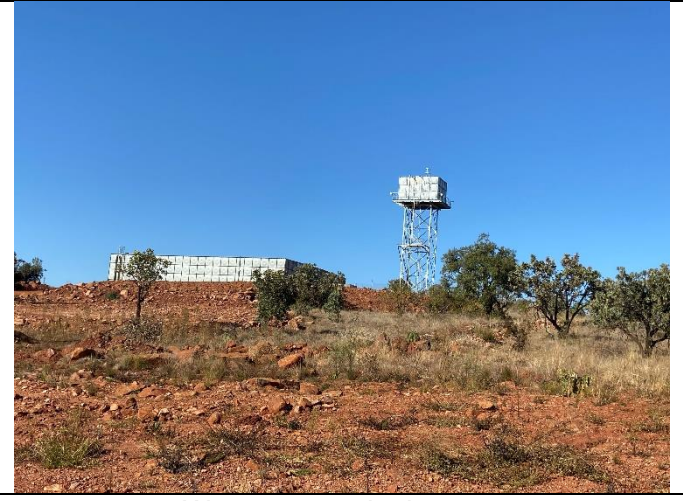
Water reservoir close-up