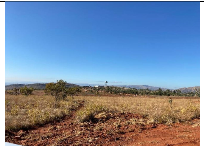
View from contractors' gate towards water reservoir