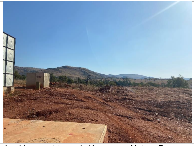
Looking west towards Kgaswane Nature Reserve (RLM water reservoir to the left)