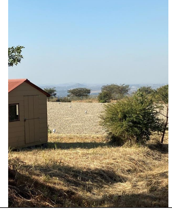
Rand Water Reservoir on property