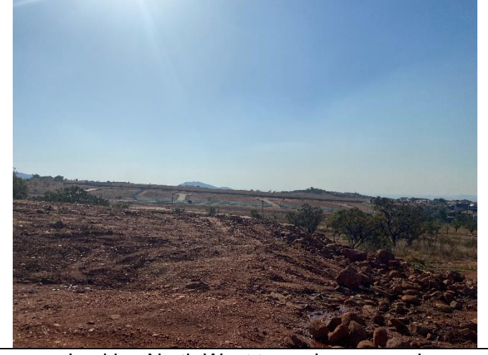
Looking North West towards approved development (roads and services already installed)