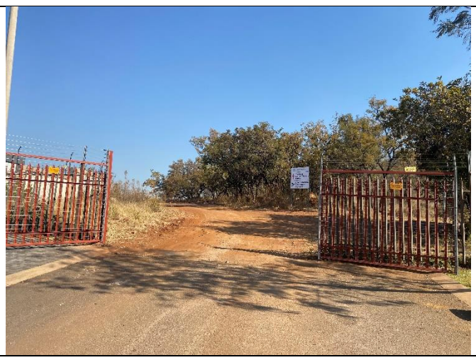
Entrance from Krokodilrivier (Rockridge Estate)