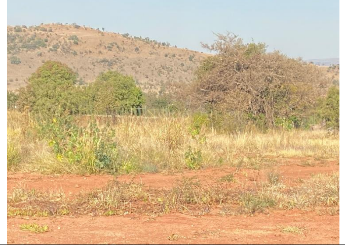
View towards property boundary (palisade fence) and Magaliesberg