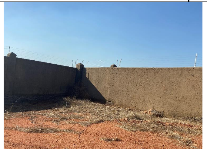
Existing boundary wall on North Western boundary