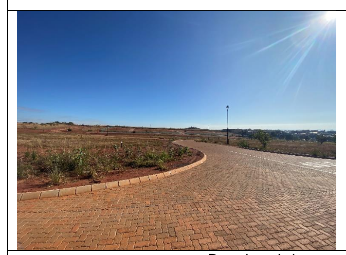
Paved roads in approved development area