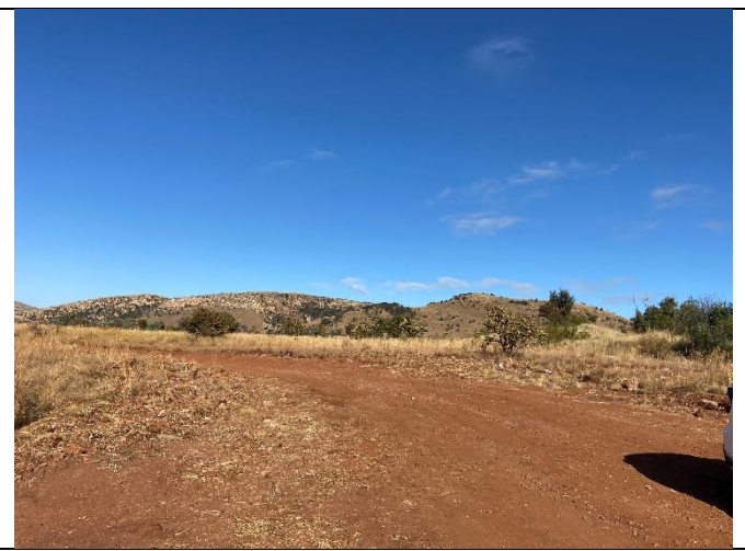
View from contractors' gate towards Kgaswane