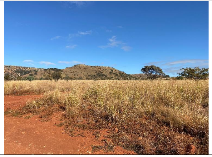
View towards Kgaswane