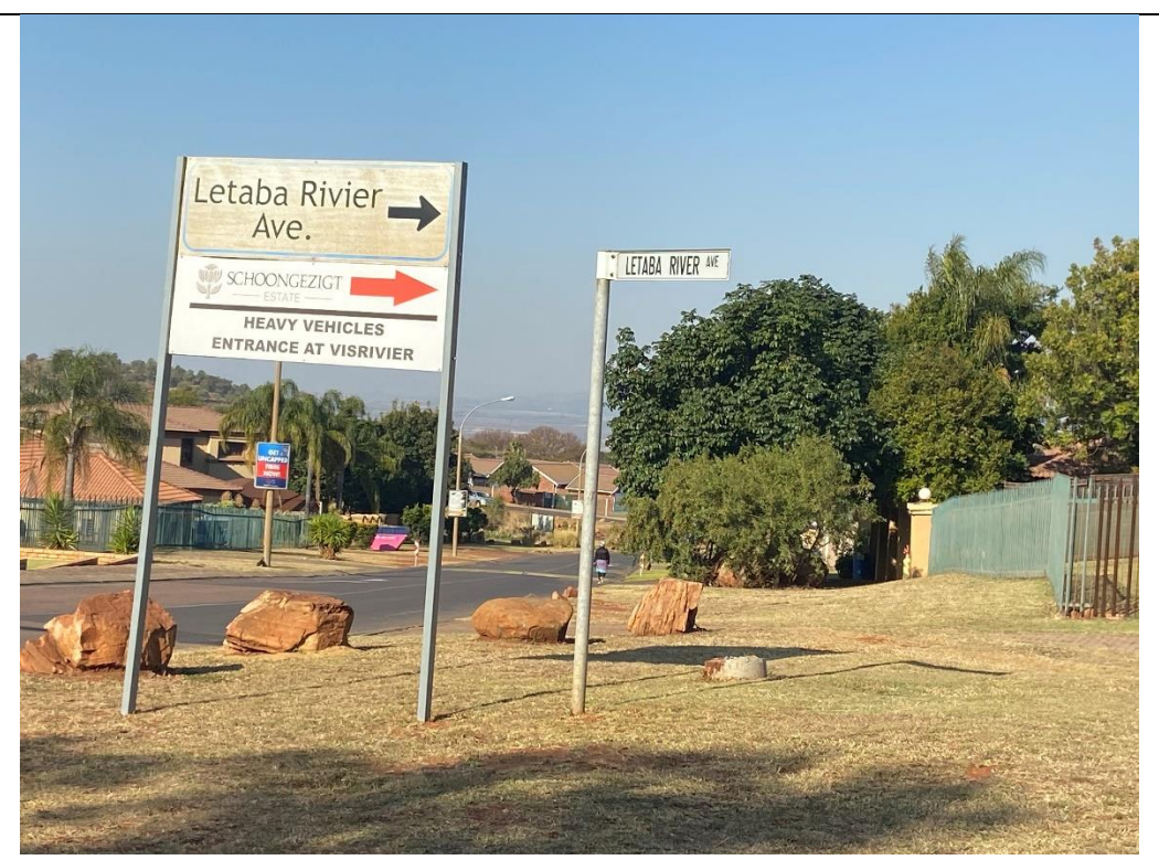
Access and entrance to Schoongezigt Estate via Letaba Rivier Avenue