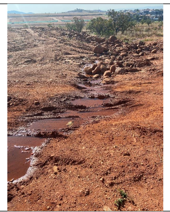
Water leaking from the RLM reservoir

Views from the RLM water reservoir site (high point)