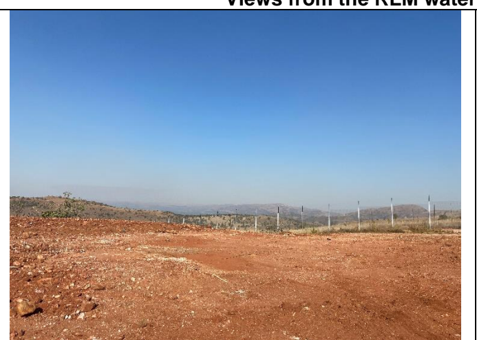
Looking South East towards property boundary (fence) and Kgaswane Nature Reserve

Views from the RLM water reservoir site (high point)