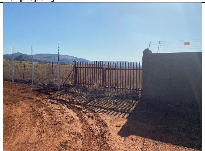
Combination of boundary fences /walls on North and Western boundaries