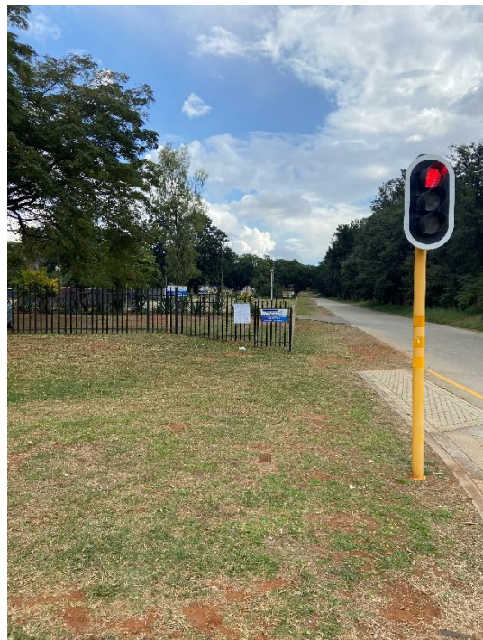
Notice at robot at entrance to site from R24 25° 42' 46.8" South, 27° 15' 25.9" East