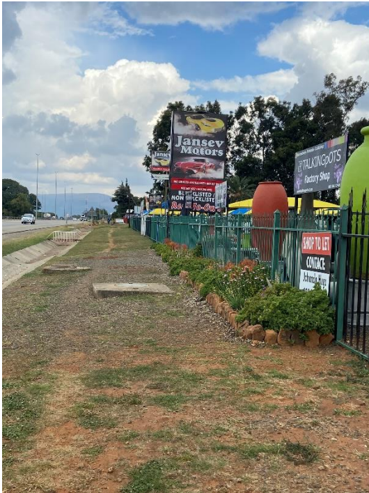
Looking south along R24 towards Olifantsnek along eastern boundary of property