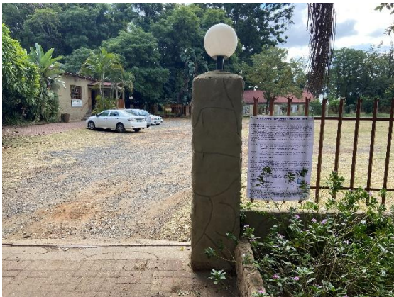
Notice at entrance to Hunters Pub & Grill 25° 42' 51.4" South, 27° 15' 19.6" East