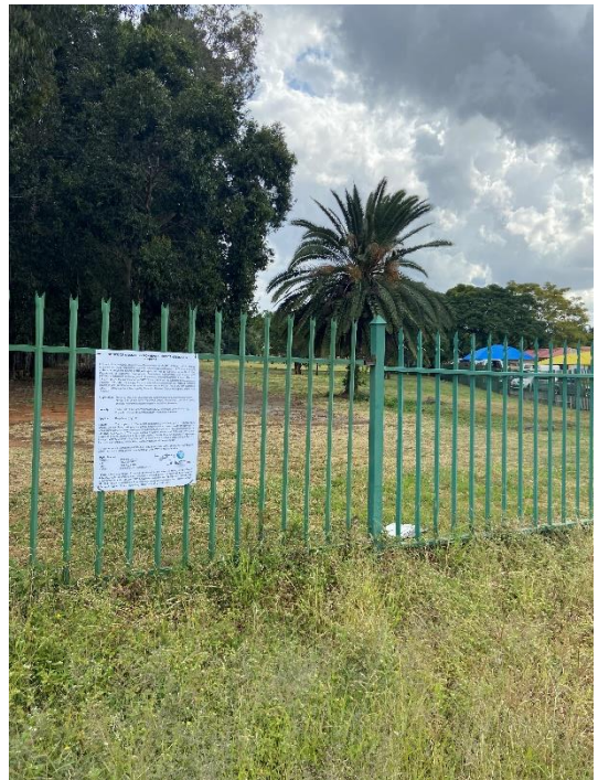
Notice along R24 south eastern corner of site 25° 42' 52.6" South, 27° 15' 28.5" East