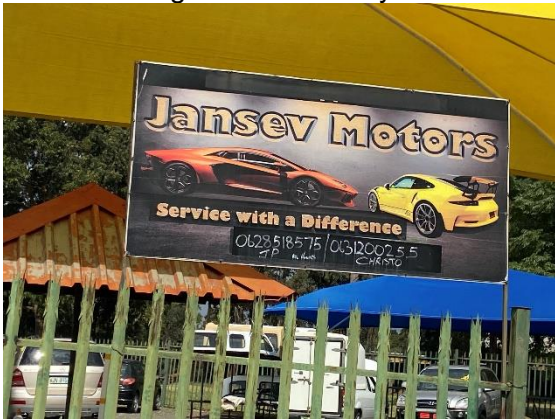
Car dealership operating from site (eastern portion along R24)