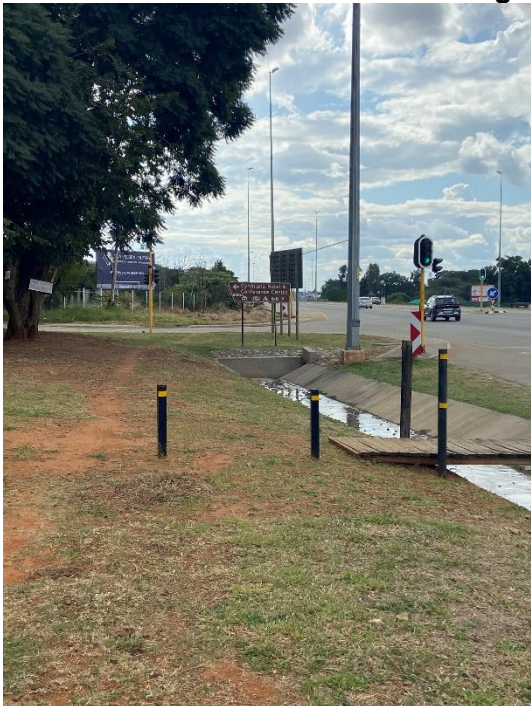
Looking north along R24 toward Rustenburg CBD from north eastern corner of site