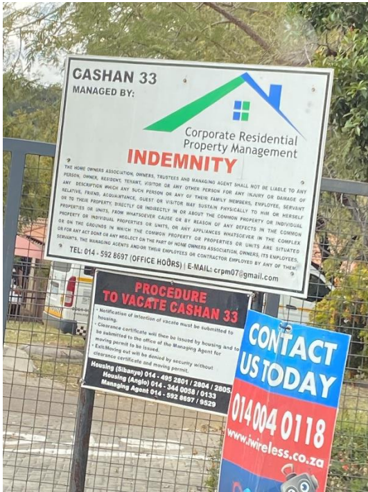
Neighbouring community to the west - Cashan 33 gated community