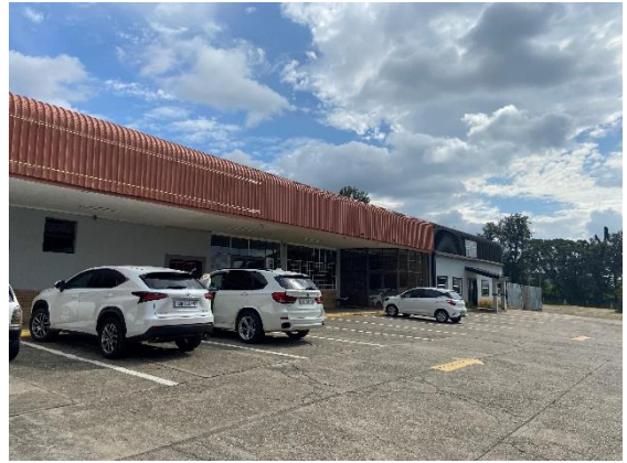
Buildings on site (eastern portion) – no longer used