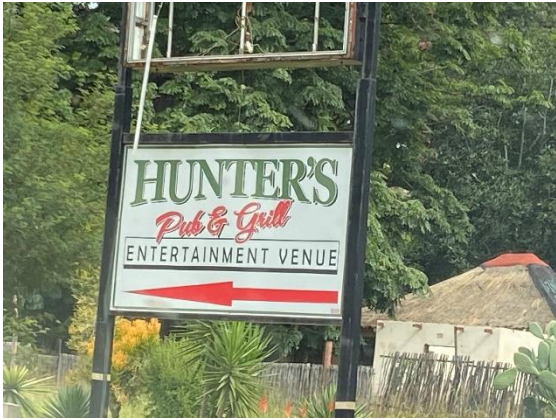
Pub & Grill operating from site