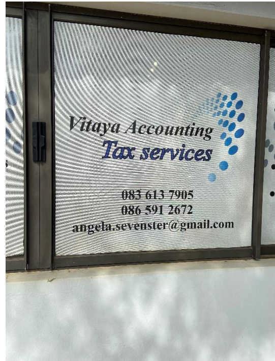
Accounting business operating from site (eastern portion)