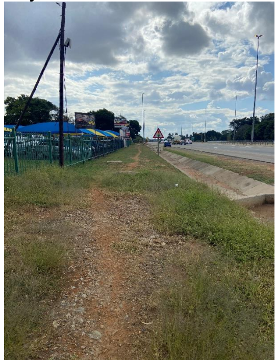
Looking north along R24 toward Rustenburg CBD from south eastern corner of site