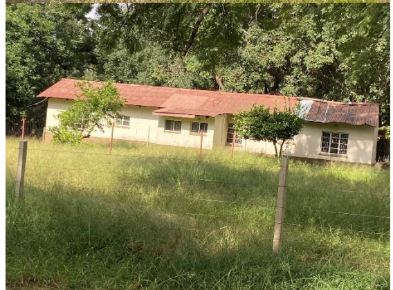
Viewed from new access road to the north