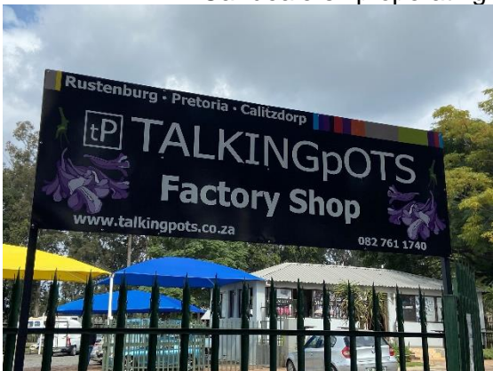
Nursery & pots business operating from site (eastern portion along R24)