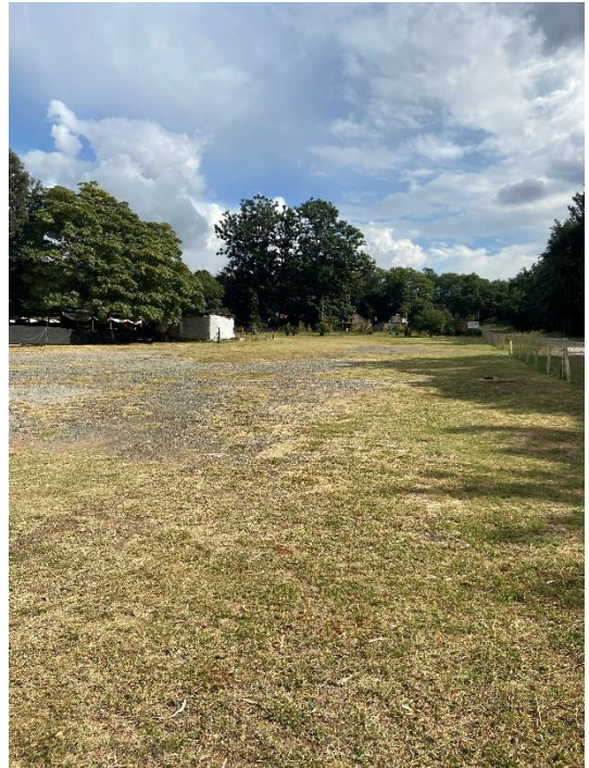
Along southern boundary of site (historic access to Cynthiana Hotel)