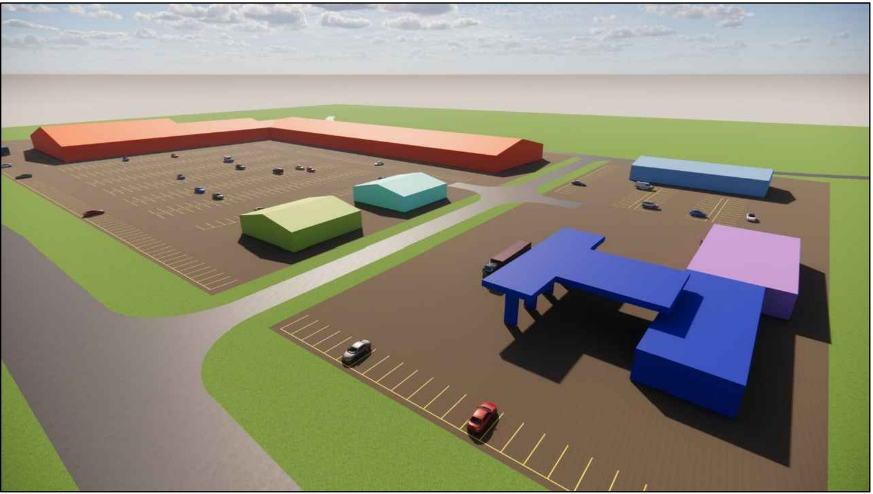
NORTH WEST VIEW