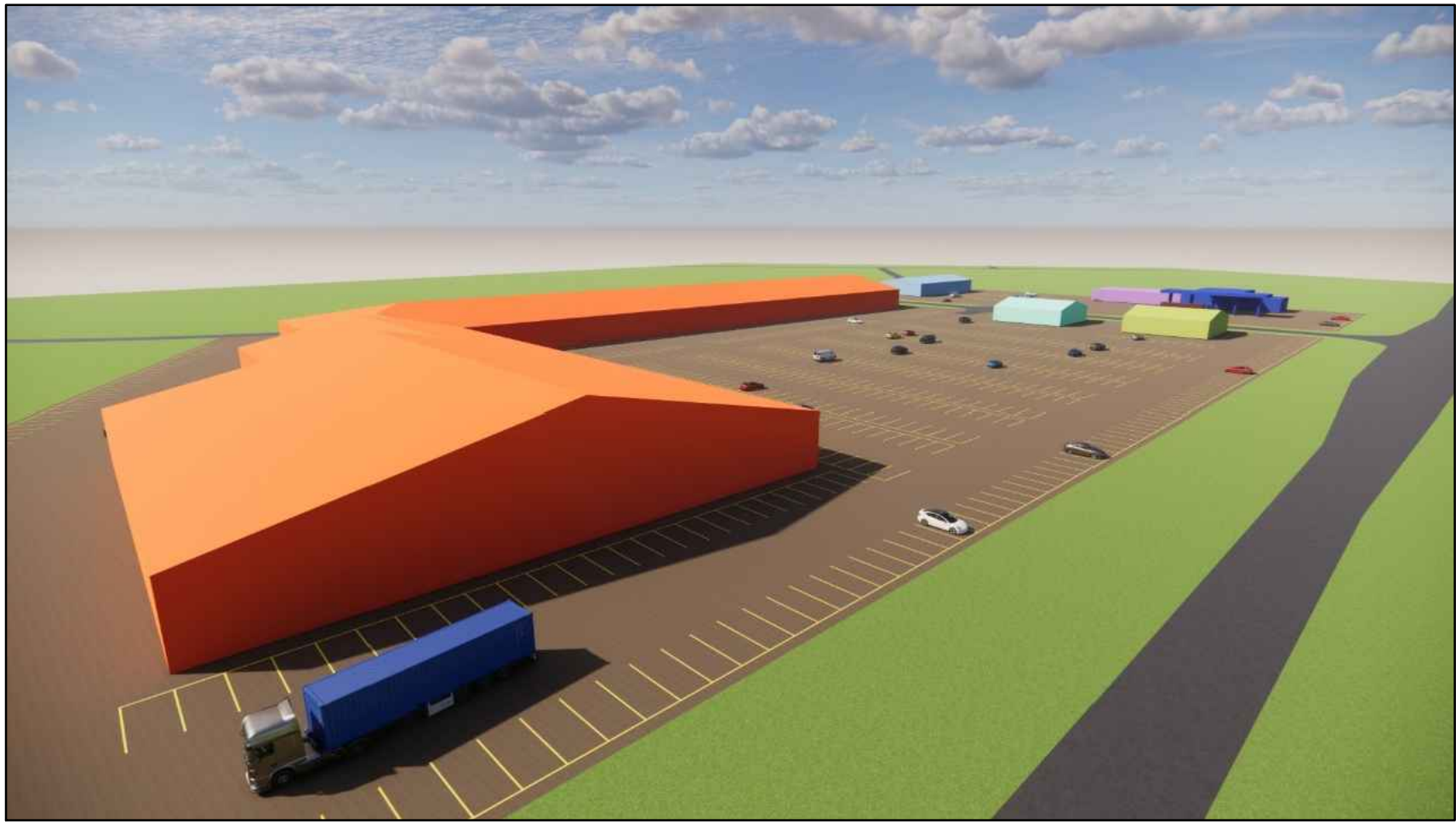
NORTH EAST VIEW